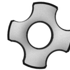
Silver, NOT Brass